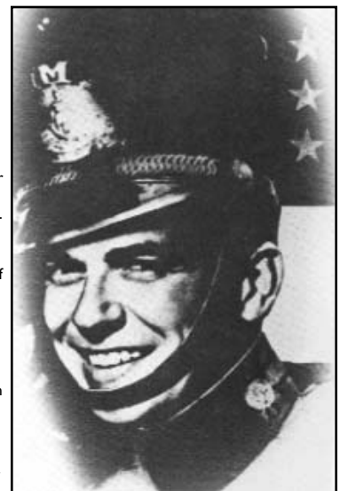
Ronald Reagan in his role as a cadet in the 1938 movie Brother Rat.