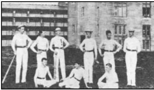
The 1885 VMI Baseball Team.

As the VMI Baseball program reaches milestones never before achieved in its history, it becomes an appropriate time to survey the rich history of baseball at the Institute, a story dating back to its early days, over 140 years ago.